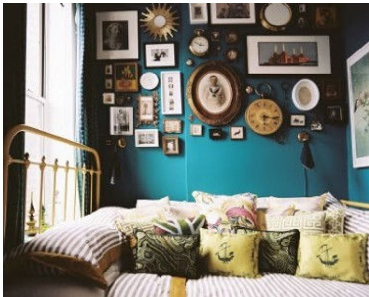
Add cushions for extra comfort