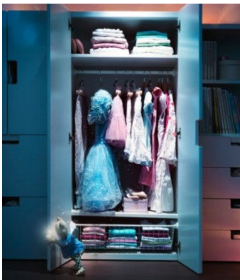
Clear the clutter

Having decided on your colour palette, keep cuttings of paint samples with you when shopping for accessories, that way you know your colour choices will compliment each other. Peacock feather greens and blues are a top trend this Autumn.